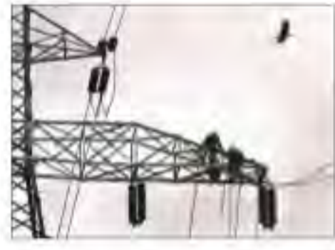
istry to form joint ventures with STUs wherever the state government approaches it.

THE UNION POWER ministry has proposed to bring all 33 kV systems, currently maintained by state distribution companies (discoms), under state transmission utilities (STUs) with an aim to improve the power distribution system.